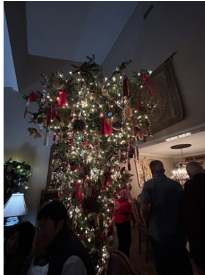
The magical upside down Christmas tree