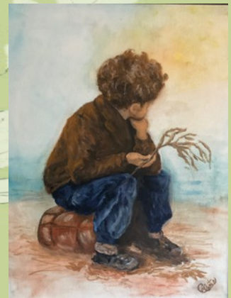
Celeste Bocian: Boy on Barrel