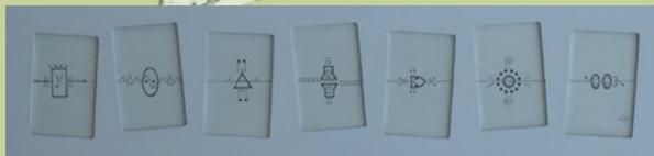
Eiji Miyamoto: Fantasy