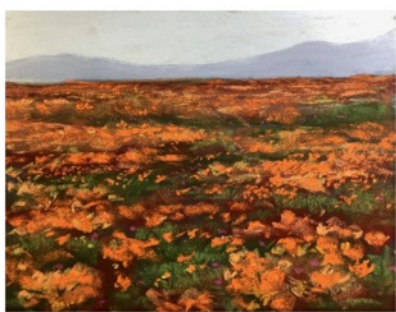
Monica Nolan - Super Bloom