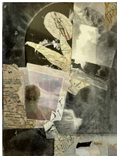
Journeys mapped in memory